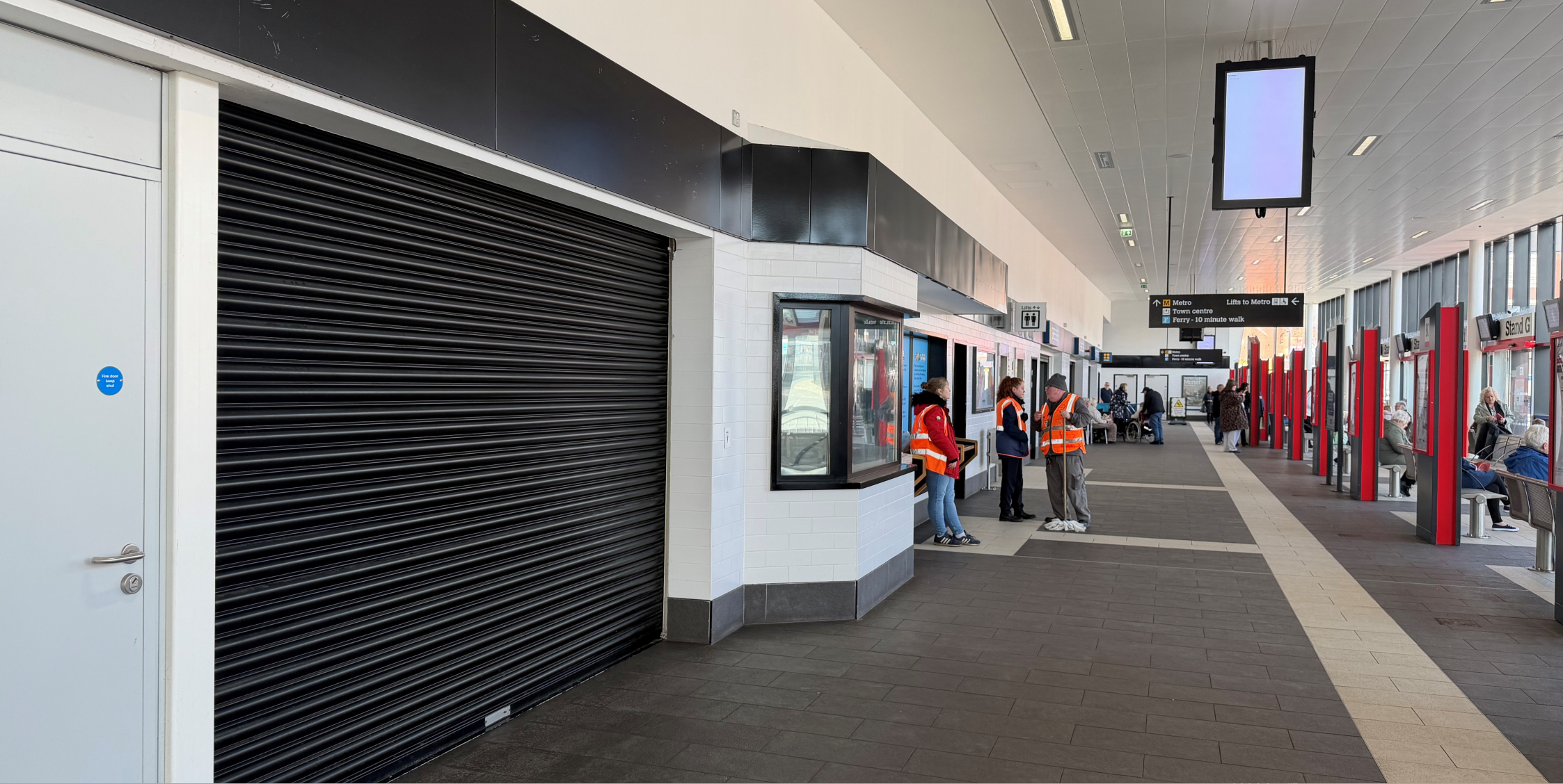
South Shields - Box Unit, South Shields Interchange, NE33 1PQ