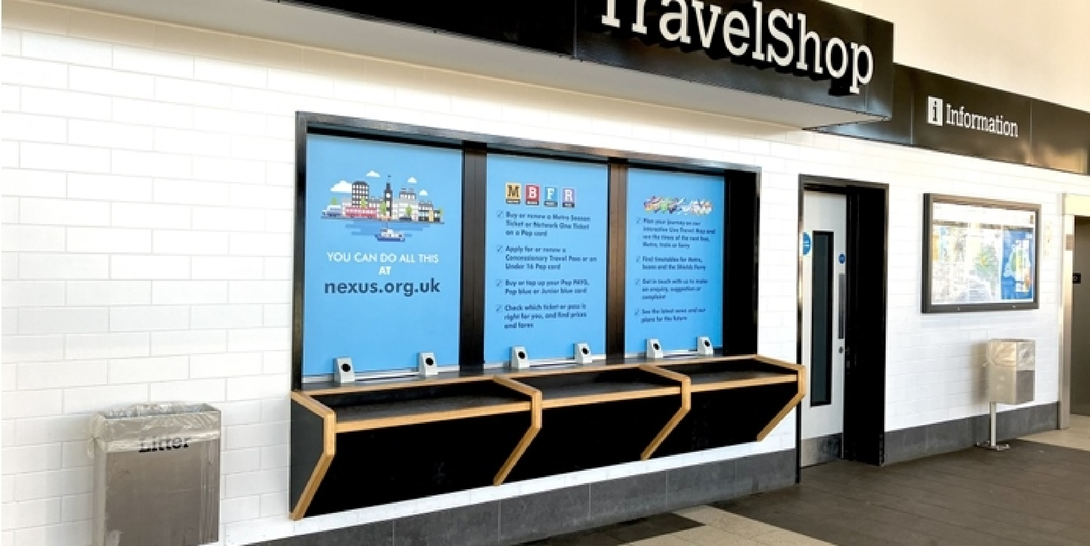
South Shields - Former Travel Shop, South Shields Interchange NE33 1DE