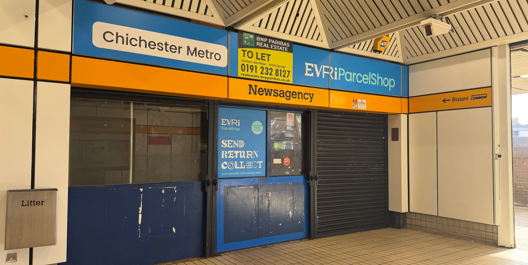
Newsagents Chichester Metro Station, Dean Road, South Shields NE33 5PZ